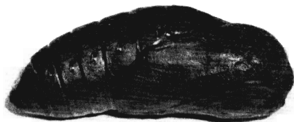
Larva and pupa of Daritis ( howardi ?).